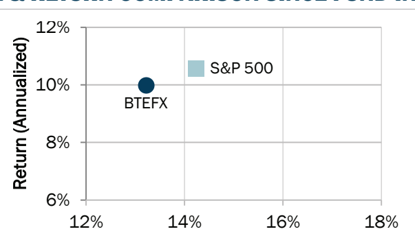
Risk (Annualized Standard Deviation)

The above chart illustrates the risk/return trade-off of the Fund relative to the index since the Fund's inception. In the illustration, risk is measured as the annualized standard deviation of monthly returns over the time period. The standard deviation is used as a measure of investment risk, and measures the degree of variation of returns around the average return. The higher the volatility of the returns, the higher the standard deviation.